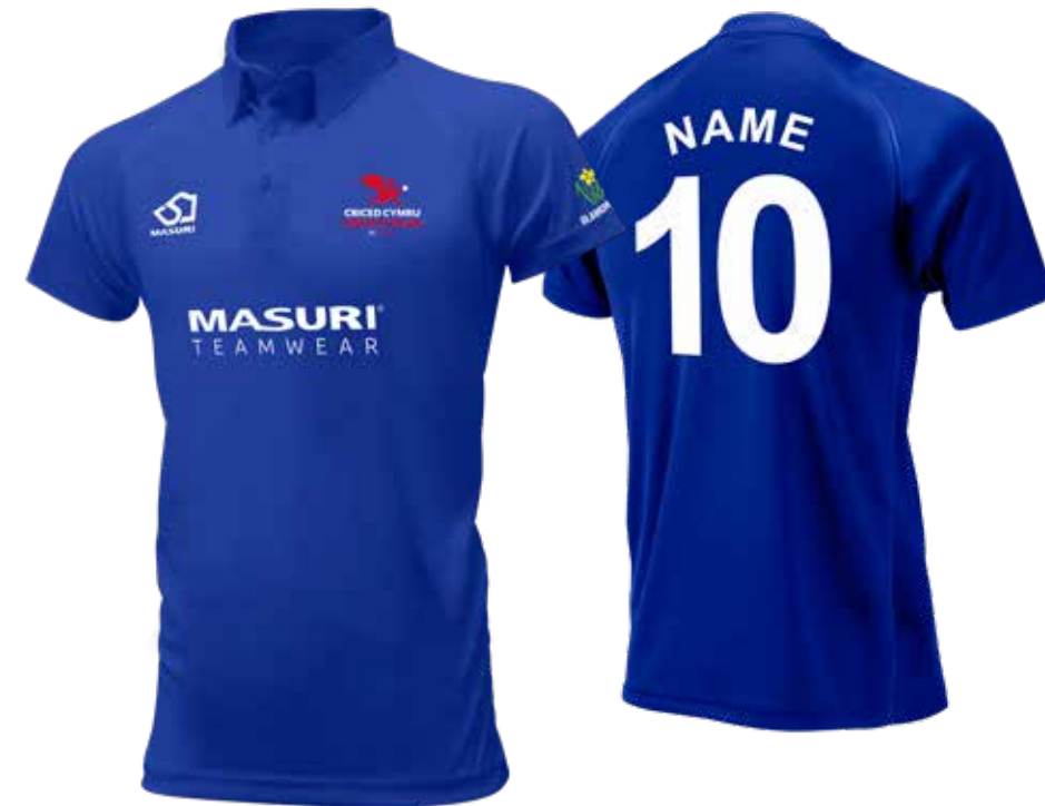
Cricket Wales playing shirts created from our core range of coloured garments.

Introducing our brand-new coloured playing kit range for the 2022 season. With more and more leagues switching to coloured kits, we have developed a solution for any white ball teamwear requirement. Building on the success and popularity of our whites, our offering now includes an extensive range of coloured playing shirts and trousers, providing a truly bespoke look for your team. All coloured playing items utilise our latest state-of-the-art logo printing technology, ensuring your players look and feel like the pros.