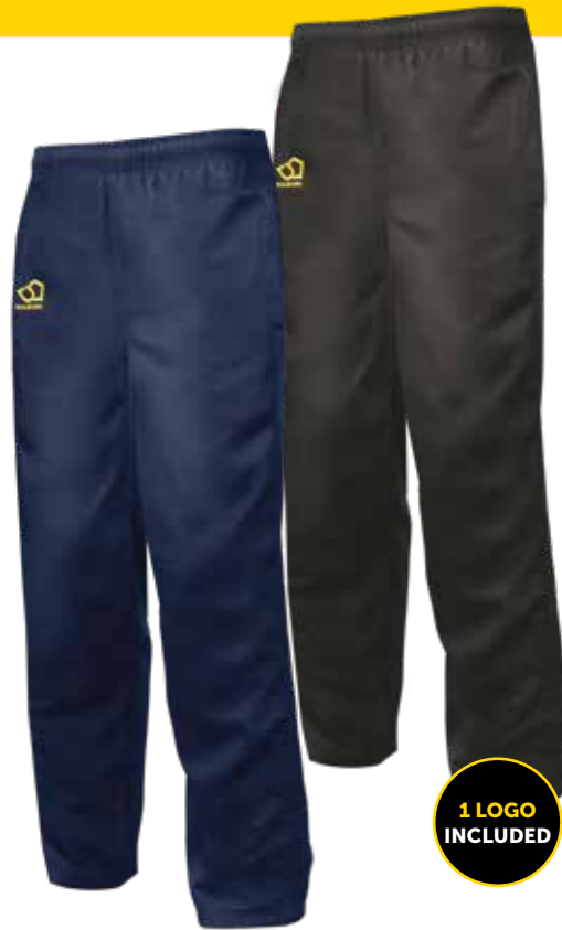
TRACKSUIT BOTTOMS MCR0063

COMPOSITION: 100% Polyester Tech-fleece (250gsm)