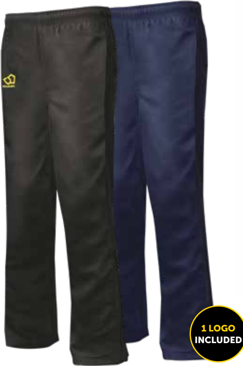
LADIES TRACKSUIT BOTTOMS MCR0095 (JUNIOR MCR0063)

COMPOSITION: 100% Polyester Tech-fleece (250gsm)