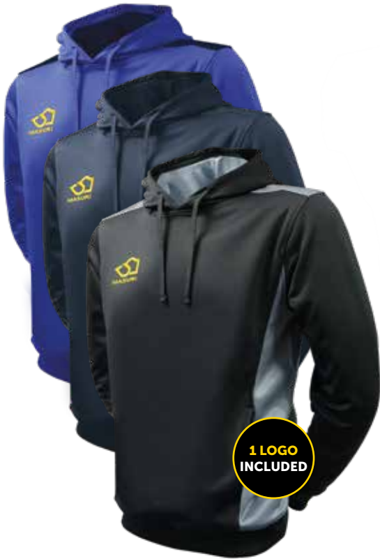
UNISEX HOODIE MCR0003

COMPOSITION: 100% Polyester Tech-fleece (250 gsm)