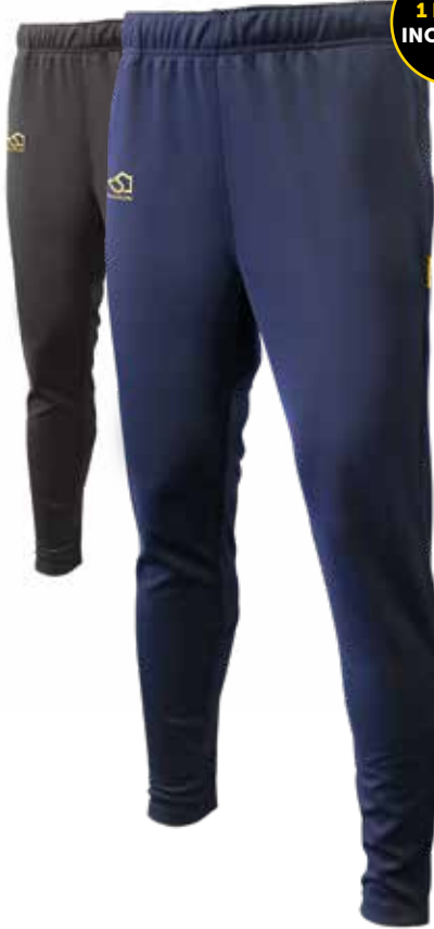
SLIMFIT TROUSERS MCR0031 (MCR0031 JUNIOR)

COMPOSITION: Main Fabric (shell): 100% Polyester Ripstop (110gsm)