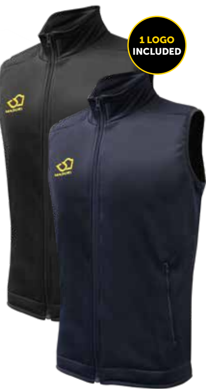
UNISEX GILET MCR0061

COMPOSITION: Main Fabric (Body): 100% Polyester Tech-fleece (250gsm)