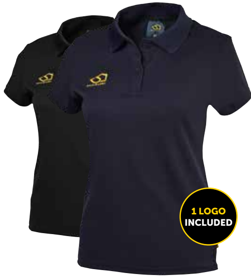
LADIES POLO SHIRT MCR0060

Short sleeve shirt with 2 button placket. Soft hand feel fabric with a solid rib collar and open sleeves giving comfort without loosing style. Masuri embroidery on right chest. Side seam tab on left seam. Regular fit.