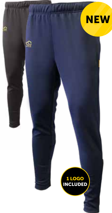
LADIES SLIMFIT TROUSERS MCR0031 (MCR0031 JUNIOR)

COMPOSITION: Main Fabric (shell): 100% Polyester Ripstop (110gsm)