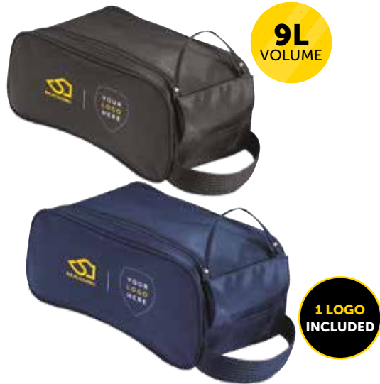
BOOT BAG MAS076

Personalised bootbag designed with webbing carrying handle. Easy to use and has a wipe-clean interior based material.