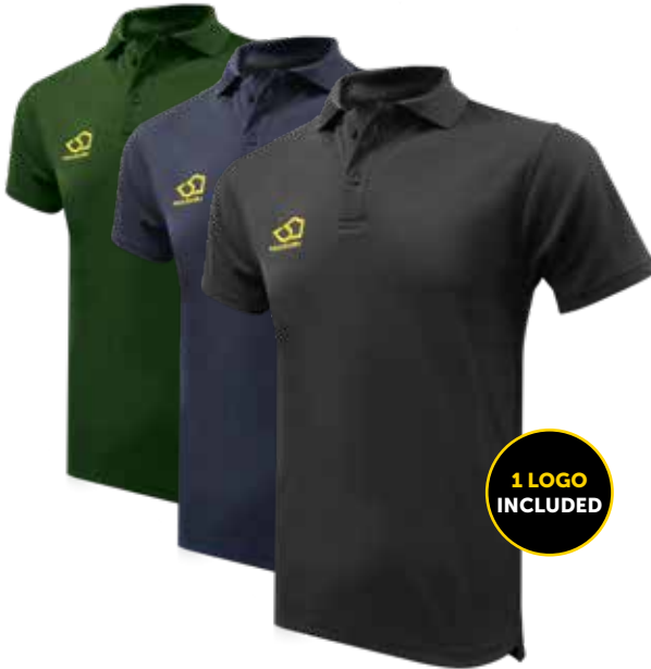
POLO SHIRT MCR0060

Short Sleeve shirt with 2 button placket. Soft hand feel fabric with a solid rib collar and open sleeves giving comfort without losing style. Masuri embroidery on right chest. Side seam tab on left seam. Regular fit.