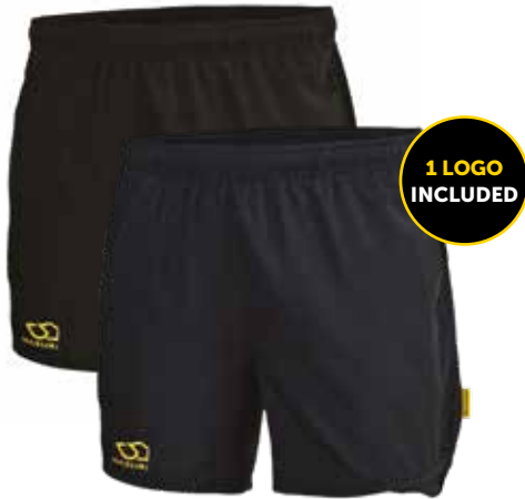
LADIES SHORTS MCR0010 (JUNIOR MCR0010)

SENIOR: 6–18 JUNIOR: 7-8 years – 13-14 years