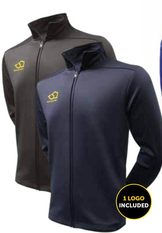
FULL ZIP TECH FLEECE MCR0062

COMPOSITION: 65% Cotton, 35% Polyester Pique (200gsm)