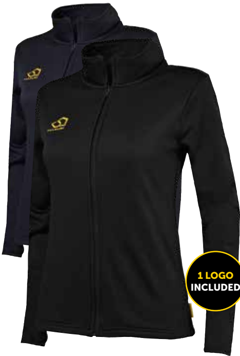
LADIES FULL ZIP TECH FLEECE MCR0062

COMPOSITION: 65% Cotton, 35% Polyester Pique (200gsm)