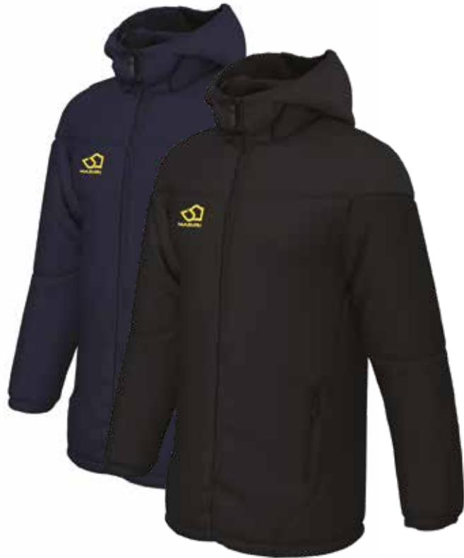
THERMAL CONTOURED JACKET MAS784

Water repellent 100% textured polyester 105gsm outer fabric combined with high loft 140gsm thermal wadding, it's extremely warm for the coldest weather.