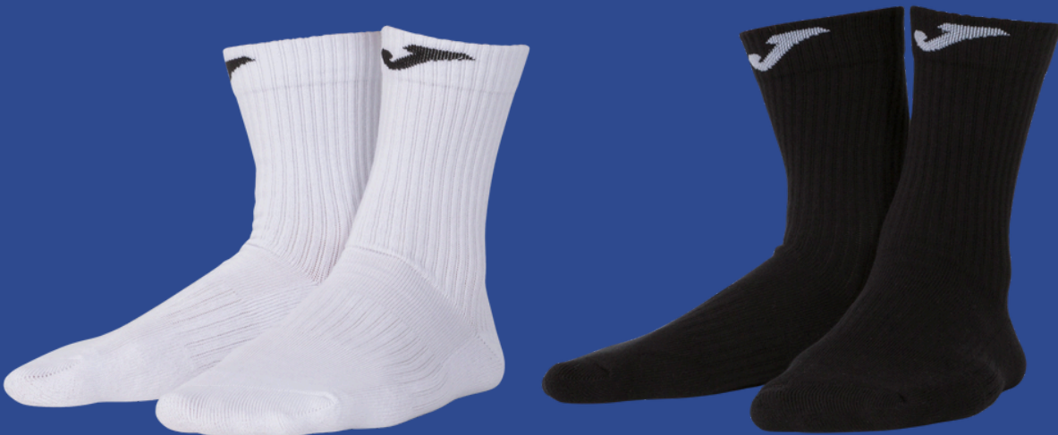
COTTON TRAINING SOCKS - 400602