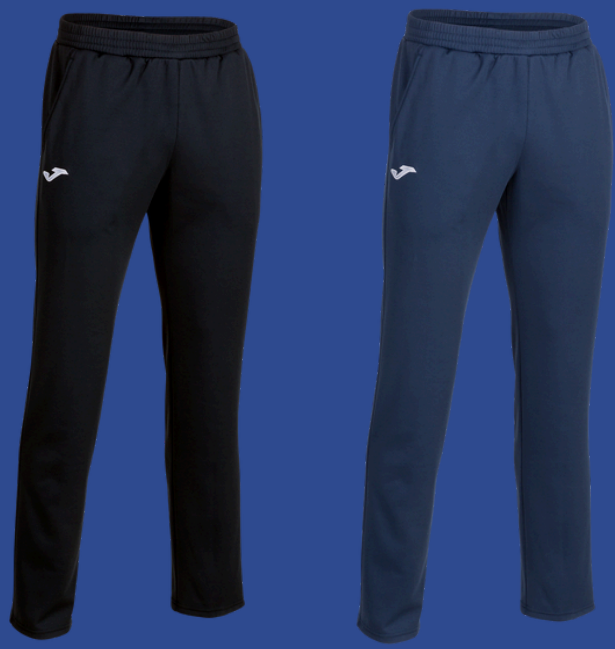
CLEO II STRAIGHT LEG PANT - 101334