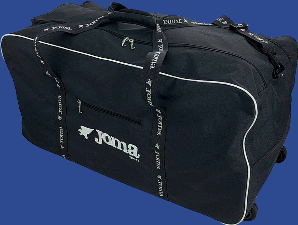
TEAM TRAVEL BAG - 40198.100