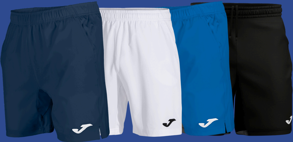
MASTER SHORTS - 100186