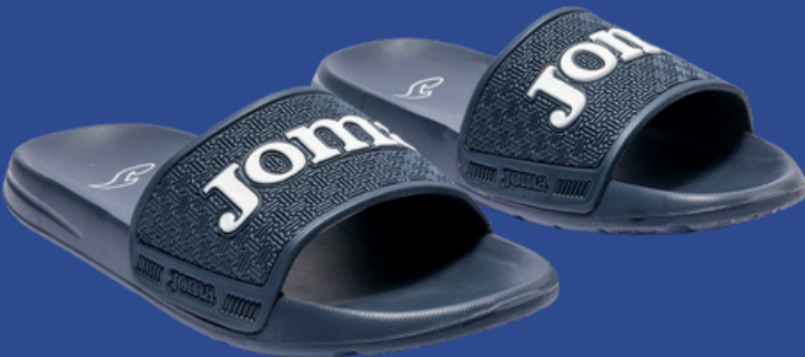
SLIDERS - SLANDS2603