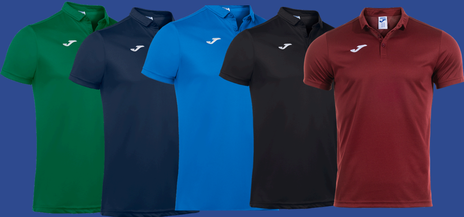
HOBBY POLO - 100437