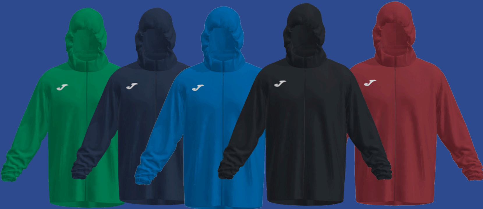
COMBI RAIN JACKET - 104796