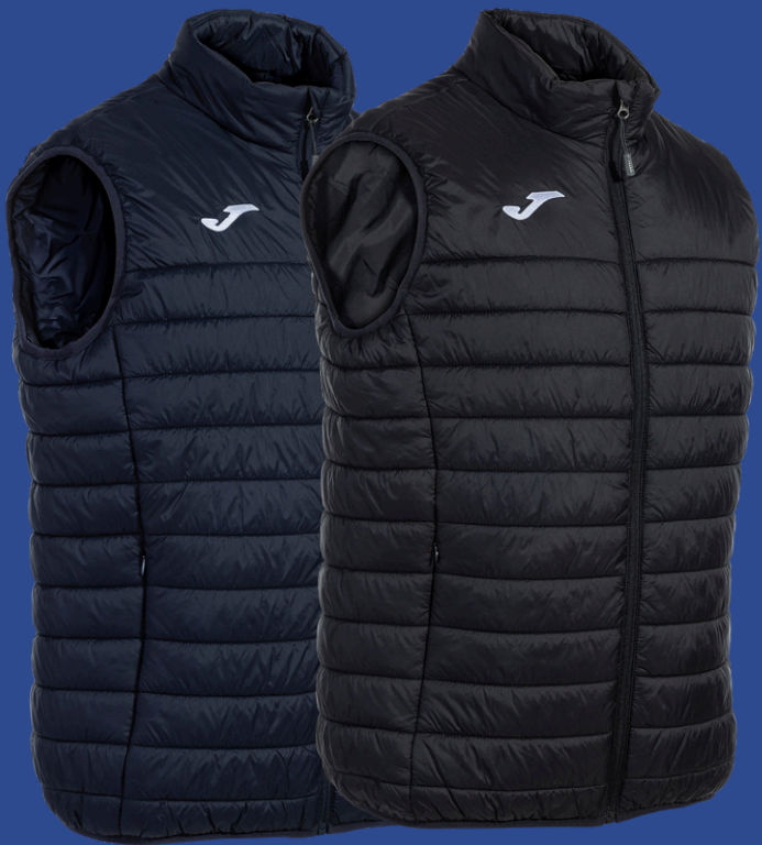
URBAN VEST - 103795