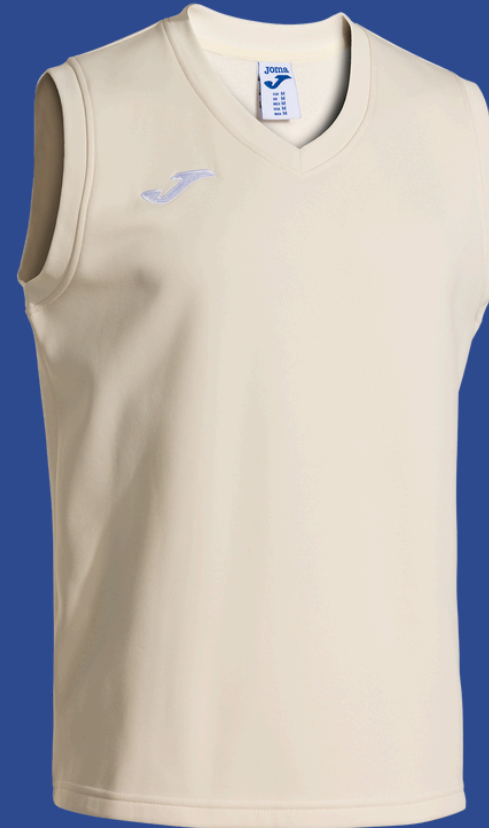
SLEEVELESS JUMPER 104445.001