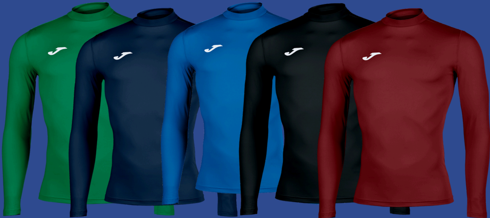
BRAMA ACADEMY - 101018