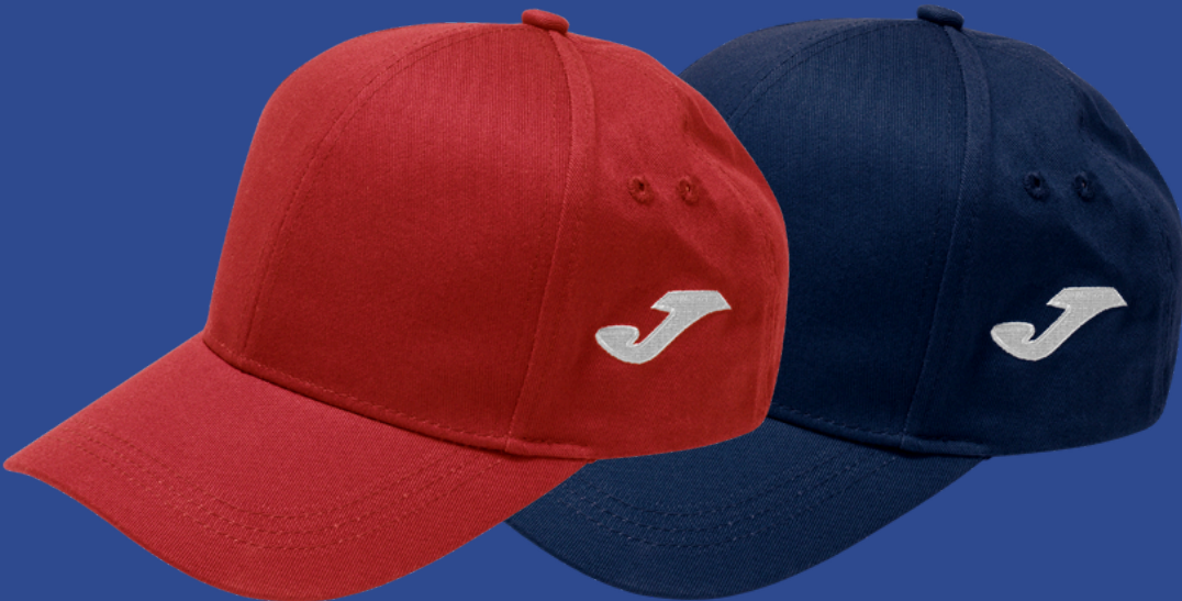
CAP - 400089