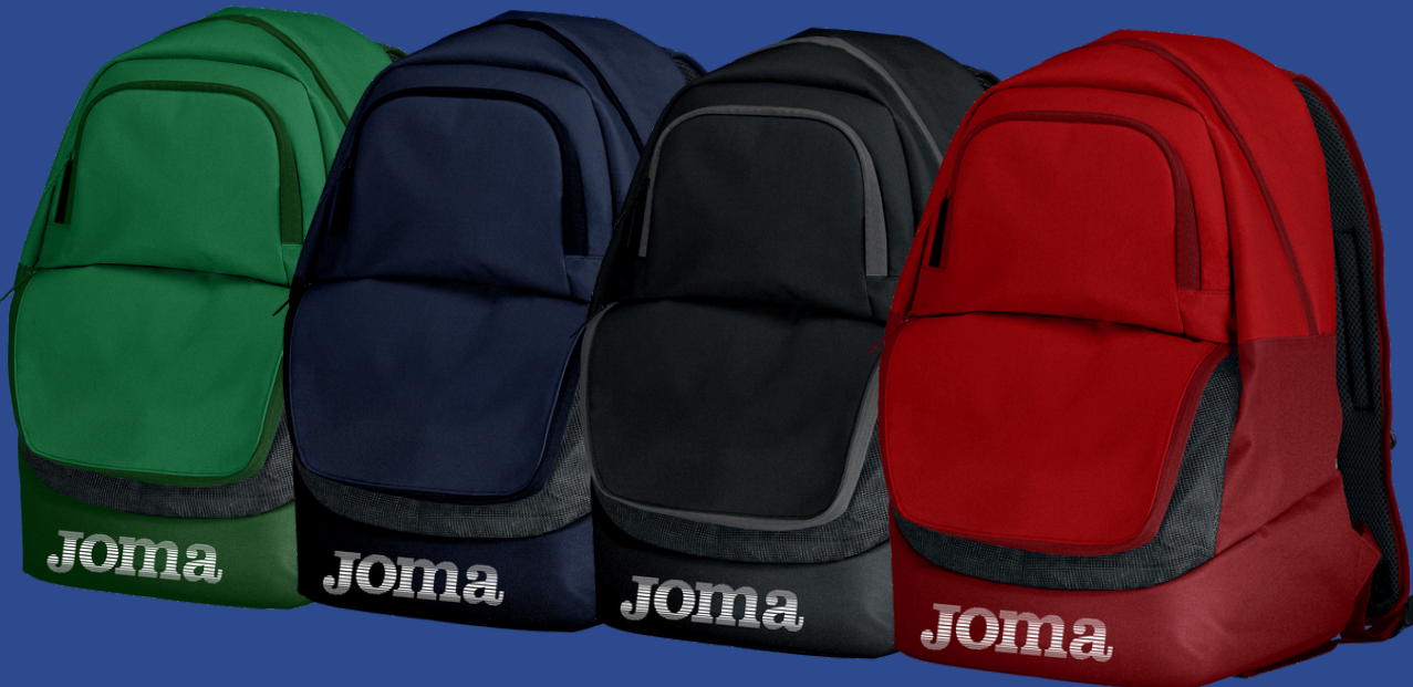
DIAMOND II BACKPACK - 400235