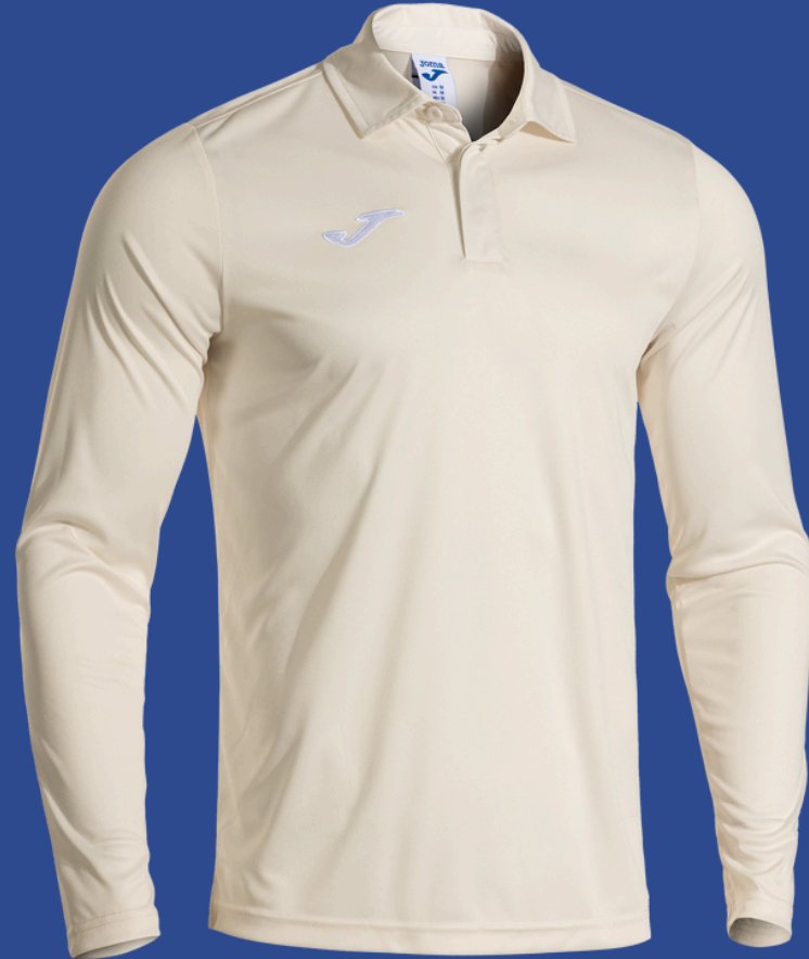
LONG SLEEVE SHIRT 104444.001