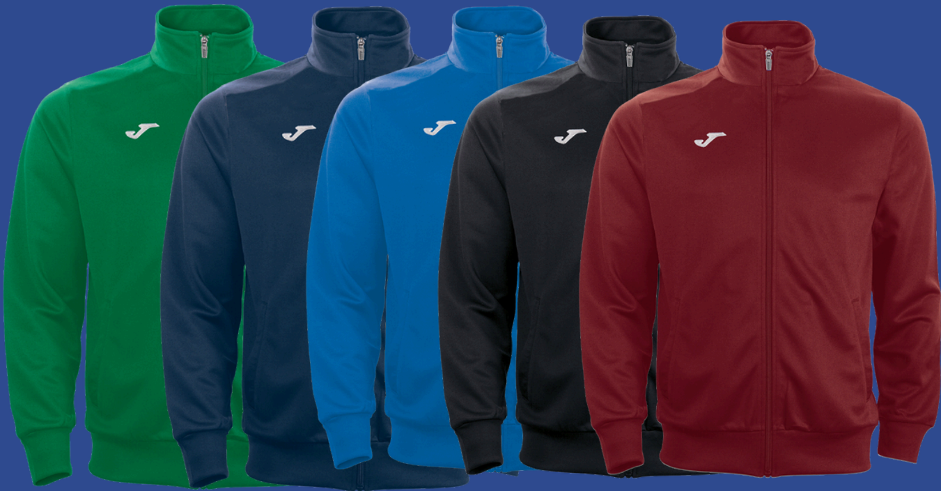
GALA FULL ZIP - 100086