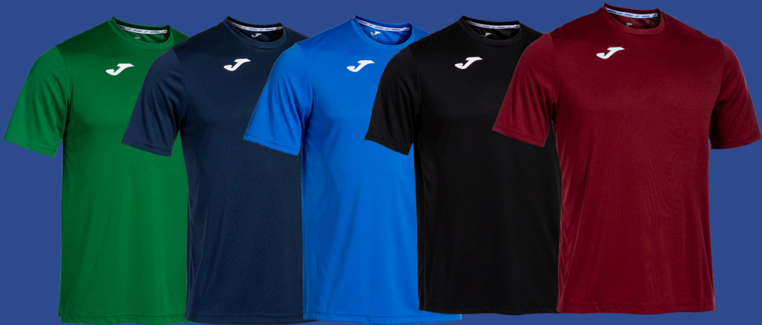
COMBI T-SHIRT - 100052