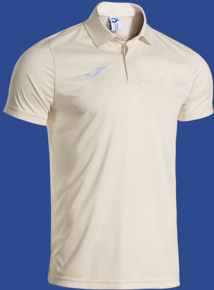
SHORT SLEEVE SHIRT 104443.001