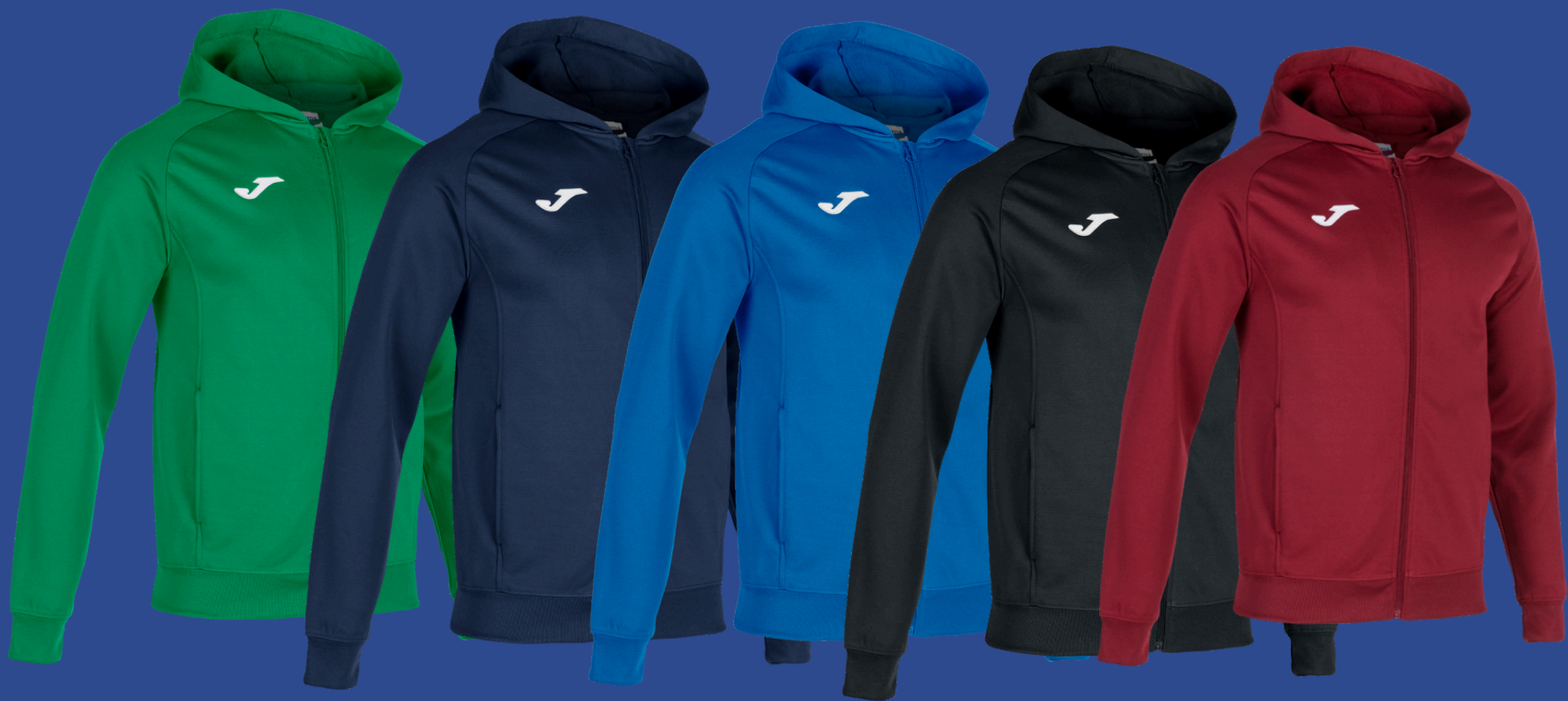
MENFIS HOODIE - 101303