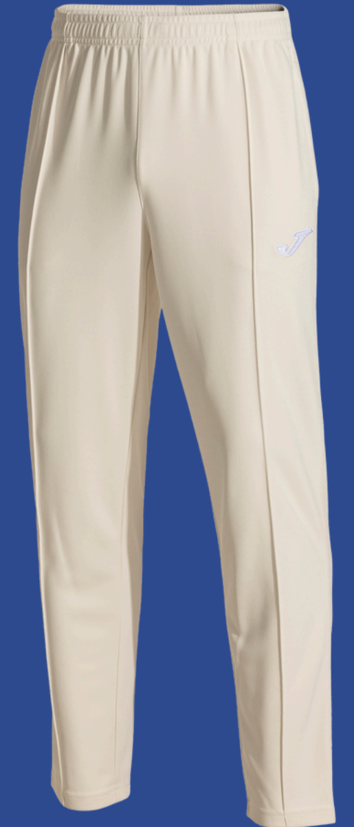
LONG PANT 104447.001