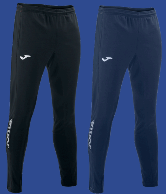
COMBI GOLD TAPERED LONG PANT 100761