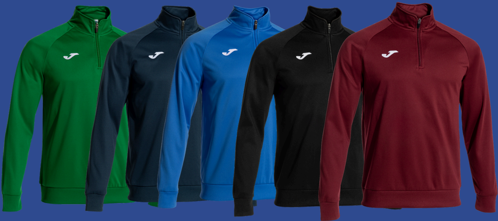
FARON ½ ZIP - 100285