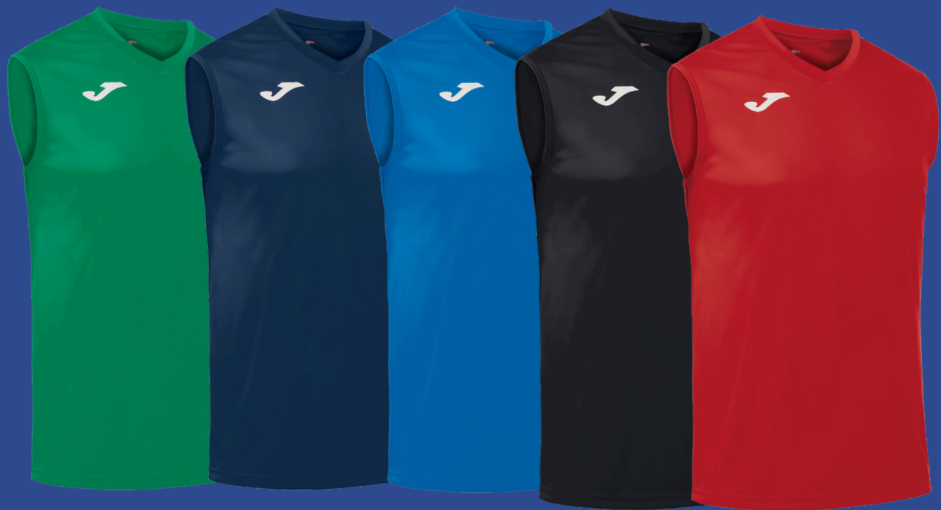
SLEEVELESS - 100436